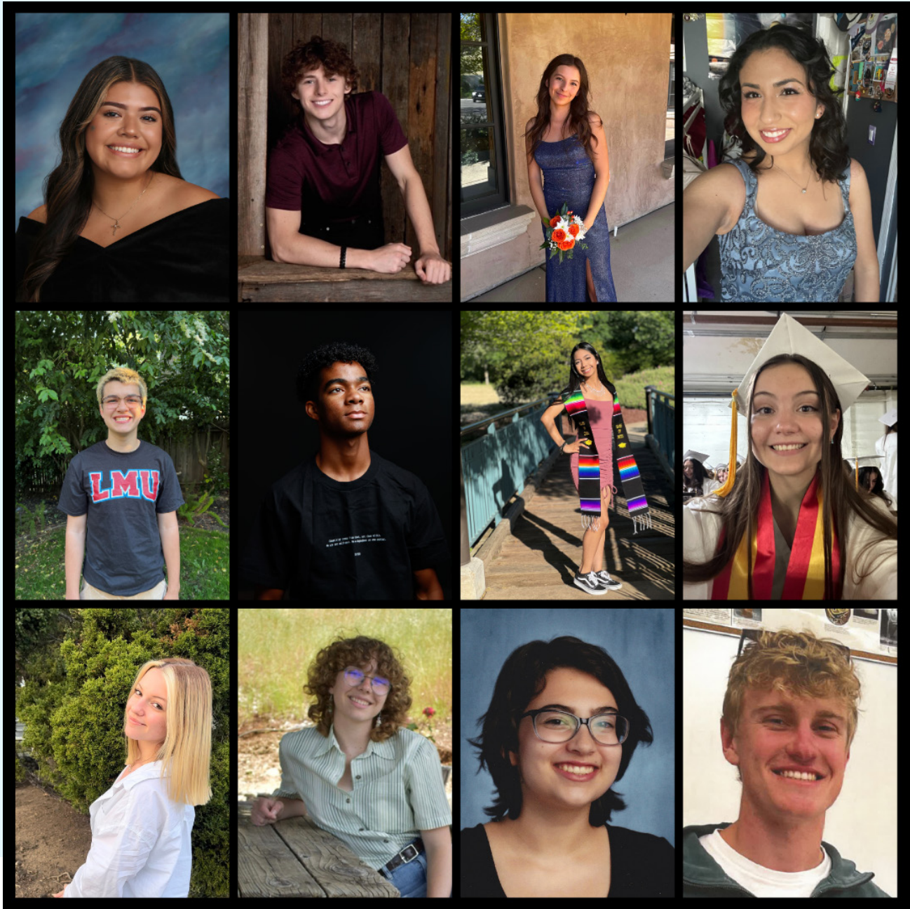
2023 SAFE Credit Union Scholarship Recipients