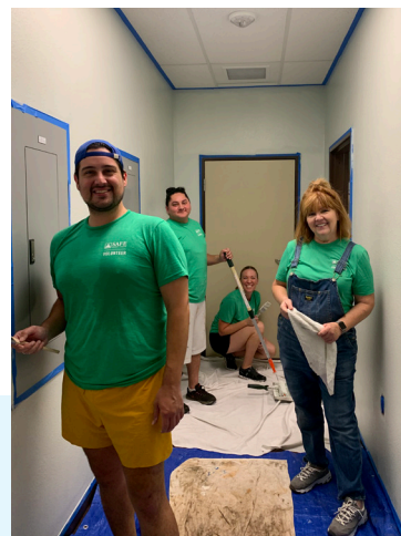
SAFE Credit Union employees volunteer at the Sacramento Food Bank, and at Saint John's Program for Real Change.